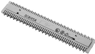
A0266827 QCBIX5A Multiplying Connector

The QCBIX2A connector is built using 24 sets of bridged clips (2 clips each). It is used to terminate various facilities where multiples of 2 are required.