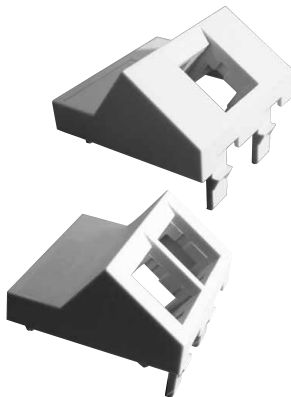
AX101415-16 French Style Faceplates

These products are in the process of being assessed for RoHS compliance. Please check our website for the most current RoHS status.