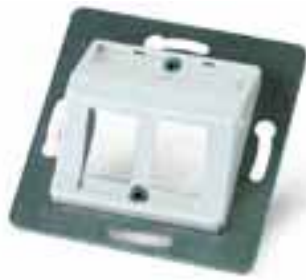
Fig. 1: Faceplate for 2 modules PS-TERA, angled