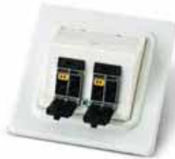
Fig. 2: Example for faceplate with 2 modules PS-TERA and cover frame