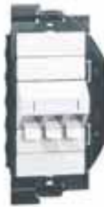
Floor box module (GB 2) for 3 RJ45 modules MS C6 A 1/8, MS 1/8 and MU 1/8, expandable to 6 RJ45 modules