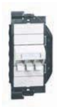
Floor Box Unit (GB 2) with insert for 3 modules MS 1/8, MU 1/8 upgrade with one additional insert