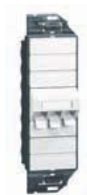
Floor Box Unit (GB 3) with insert for 3 modules MS 1/8, MU 1/8 upgrade with two additional inserts