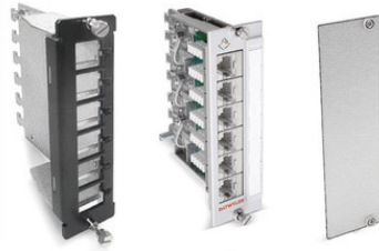
1 Subrack 19"/3U