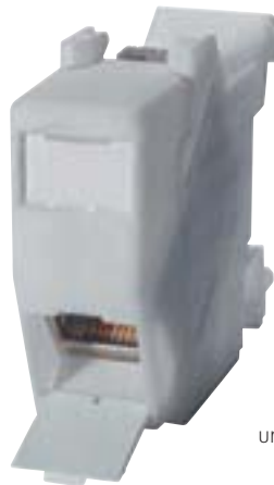
unilan® DIN-Rail (REG)-Adapter for 1 Module MS 1/8