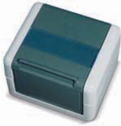
Connector Box IP44 for 2 modules surface mounted