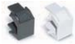
Blank covers in black and white, for Keystone openings in Patch Panels