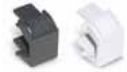
Blank covers, black and white