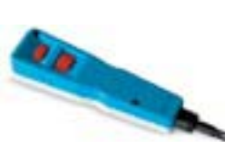
Insertion Tool 110