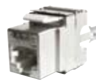
KS 1/8 Cat. 6, shielded