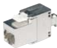
KS-TS 1/8 Cat. 6, shielded tool-less