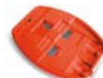
unilan® Keystone Hand Puck