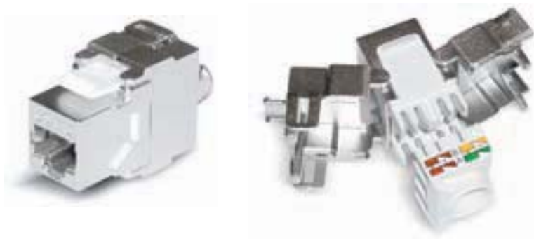
unilan® Module KS-T 1/8 Tool-less Cat. 5e shielded