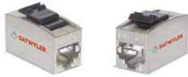
RJ45 Keystone Coupler (RJ45-RJ45), 180°, straight

Cat.6 Link/Class E, 180 degree, straight