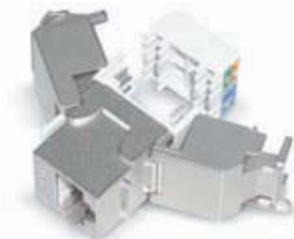
unilan® Module KS-T 6A 1/8 Tool-less Cat. 6A/E A shielded