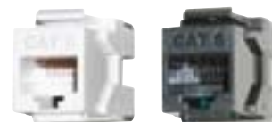
KU 1/8 Cat. 6, unshielded