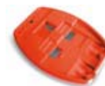
unilan® Keystone Hand Puck