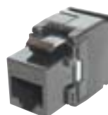
KU-T 1/8 Cat. 6, unshielded tool-less