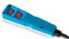
Insertion Tool 110