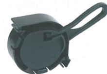
Recommended clamp TELENCO Code 7593