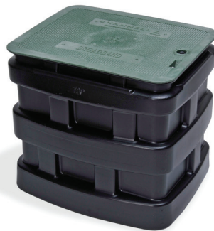
GLB1620 L-Bolt Cover Top Inside Dimensions: 16.0" Width X 20.0" Length (406.4mm X 508.0mm ) Depth: 18.0" (457.2mm)