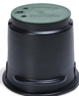
GLB912 L-Bolt Cover Top Diameter: 9.5" (241.3mm) Depth: 12.0" (304.8mm) Bottom Inside Diameter: 12.5" (317.5mm)