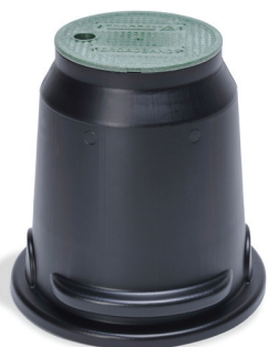
GLB610 Snap-in Cover Top Diameter: 6.0" (152.4mm) Depth: 10.0" (254.0mm) Bottom Inside Diameter: 8.5" (215.9mm)

Channell provides High Density Polyethylene (HDPE) grade level boxes and lids in a variety of depths and sizes for greenbelt applications. These boxes are designed to meet the specific fiber, coax and copper needs of the broadband, telecommunications and utilities industries. They can be used in areas of pedestrian traffic in conjunction with various Channell products in below grade applications.