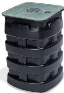
GLB1111 L-Bolt Cover Top Inside Dimensions: 11.0" Width X 11.0" Length (279.4mm X 279.4mm ) Depth: 16.0" (406.4mm)