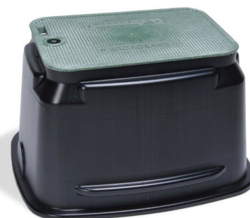
GLB1419 L-Bolt Cover Top Inside Dimensions: 10.0" Width X 15.0" Length (254.0mm X 382.0mm ) Depth: 12.0" (304.8mm) Bottom Inside Dimensions: 14.0"Width X 19.0" Length (355.6mm X 482.6mm) (Available with 6" (152.4mm) extension)