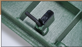
“L” Bolt Cover Security