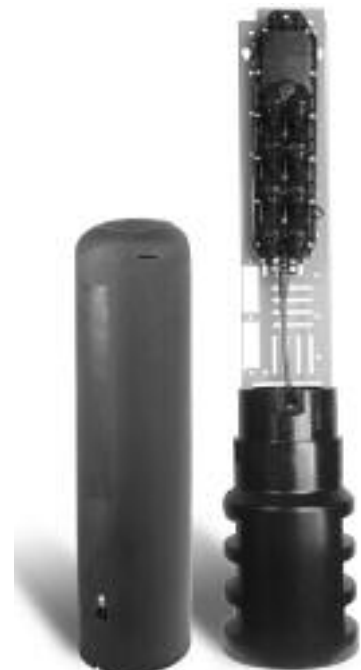
MAH8800 shown with fiber tap installed