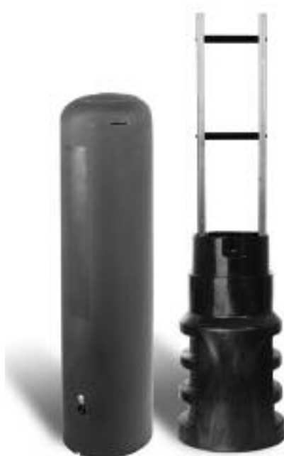
MAH8800 shown with splice ladder loop bundle support installed