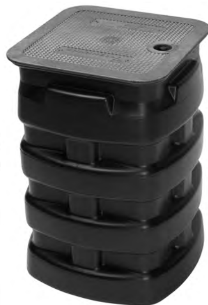
GLB1111 Grade Level Box