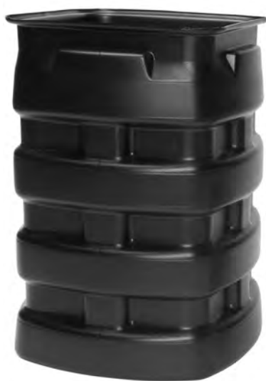
GLB1111 Grade Level Box (Cover Removed)

Inside Dimension: 11" X 11" (279.4mm X 279.4mm) Depth: 16" (406.4mm)