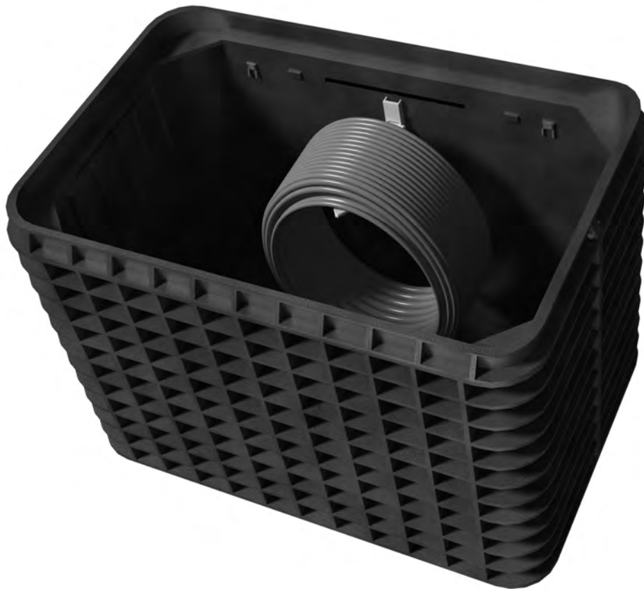
SGLB 3048 36 with storage for 650 ft. (200 meters) of 0.5" diameter fiber optic cable