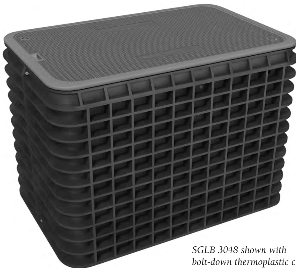
SGLB 3048 shown with bolt-down thermoplastic cover

Channell's factory installed stud system allows a full range of options including the installation of a galvanized rack system, horizontal brackets and a two-position swing arm bracket. All of these options can be pre-installed at our factory or installed in the field after vault installation. The SGLB 3048 can easily store 650 Ft. (200 meters) of 0.5" diameter fiber cable, in addition to the industry's largest fiber splice cases.